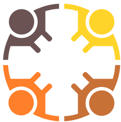
there I Am in the midst

And I said to the man who stood at the gate of the coming year: “Give me a light that I may tread safely into the unknown.” And he replied: “Go out into the darkness and put your hand into the Hand of God. That shall be to you better than light and safer than a known way.”