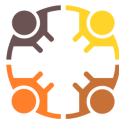
there I Am in the midst

small group ministry at FPC. We prayed hard for five small groups to begin with, the leaders to lead them, and the people to populate them. God fulfilled His promise on all accounts! We have five micro-communities now meeting and busting at the seams! What a wonderful thing to give Him praise for. It is such a blessing to feel so undeniably led by God and see how He works in our midst to make that thing happen.