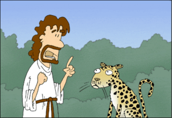
LEPERS ... I HEAL LEPERS