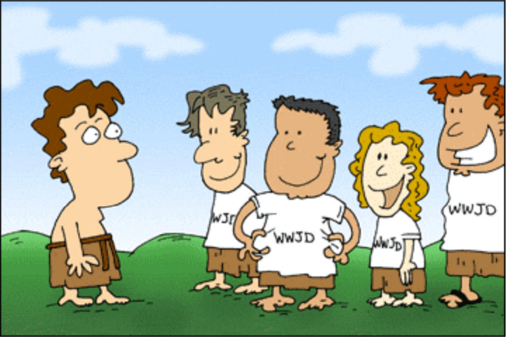
08-20-2007 YOUNG JESUS FOUND THIS TO BE A GOOD THING IN GENERAL ... THOUGH A LITTLE AWKWARD AT TIMES